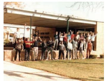
Photo Recovered From A Dumpster Behind ND in August of 2007