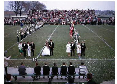
1961 Homecoming